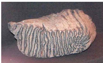
Canvey Mammoth tooth

The Essex Field Club has serious interests in geology, flowering plants, fungi, mosses, lichens, mammals, reptiles and amphibians, insects (e.g. beetles, butterflies, moths, flies, bugs, dragonflies, bees and wasps), and other invertebrates (e.g. spiders, snails and slugs), and values both amateur and professional members.