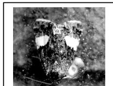
Festoon, Kent Black Arches and Four-spotted